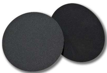
ROUND PADS FOR DRY GRINDING AND POLISHING OF PRECAST ELEMENTS