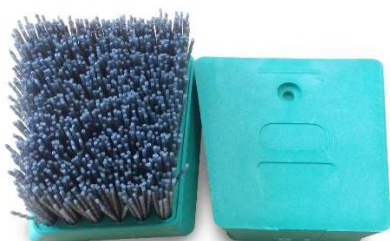
BRUSHES WITH SILICON CARBIDE FIBERS FRANKFURT TYPE