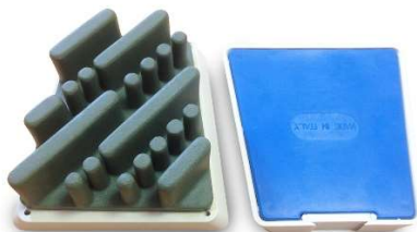
RUBBER PADS FRANKFURT TYPE