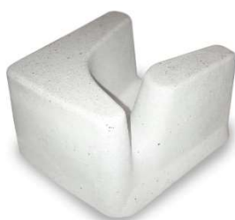
ABRASIVE FRANKFURT TYPE MAGNESITE OR POLYESTER BOND